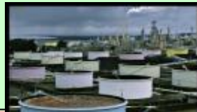
let us to be your problem solving partner .